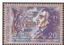
Dmytro Bortnianskyi (1751-1825)

Bro. Bortniansky's actual Lodge is not known but he is shown as having been a Freemason in the St. Petersburg Encyclopedia . He wrote music for Masonic hymns based on poems by M. M. Kheraskov, including How Glorious is Our Lord in Zion . He is shown on a stamp issued by the Ukraine on July 26, 2001 for the 250 th anniversary of his birth.